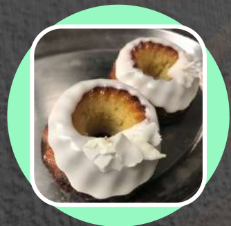
COCONUT & ALMOND MINI BUNDT