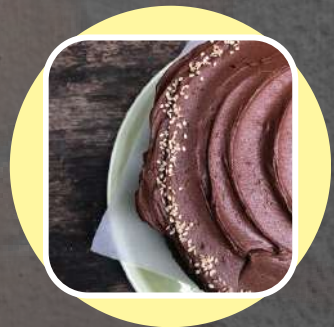
CHOCOLATE & TAHINI DOUBLE LAYERED CAKE -8" serves 10 for £40