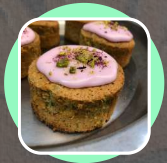
ROSE & PISTACHIO FRIENDS