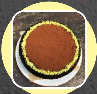
CHOCOLATE & PISTACHIO FLOURLESS CAKE -8' serves 6-8 for £32