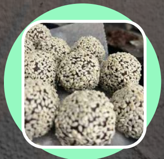
DATE & NUT BALLS