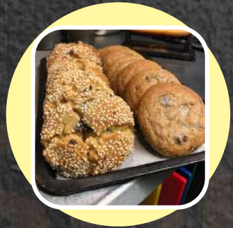
TAHINI, HAZELNUT & CHOC CHIP COOKIES