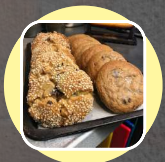
BROWN BUTTER SALTED CHOC CHIP COOKIES