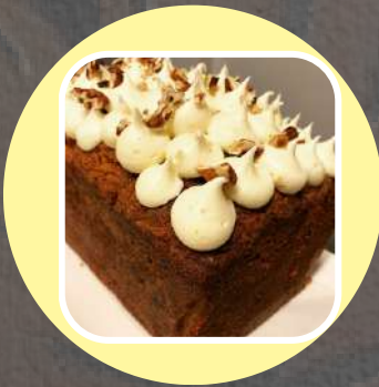
CARROT & GINGER LOAF -loaf serves 6-8 for £26