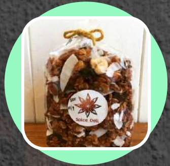
COCONUT, BANANA, ALMOND & DATE GRANOLA