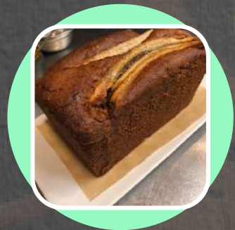
BANANA & DATE LOAF