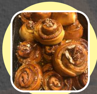
STICKY CARDAMOM & CINNAMON BUNS -min 8 buns for £38