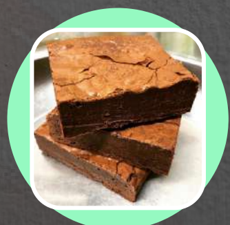
CHAI SPICED / PEANUT BUTTER / PISTACHIO HALVA BROWNIES